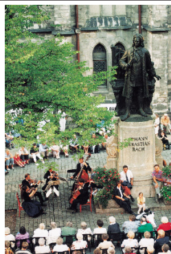
Concert in Leipzig