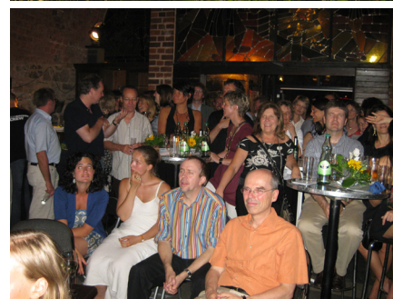
The photos from Leipzig and WAIMH 12th World Congress in Leipzig by Minna Sorsa /WAIMH Office.