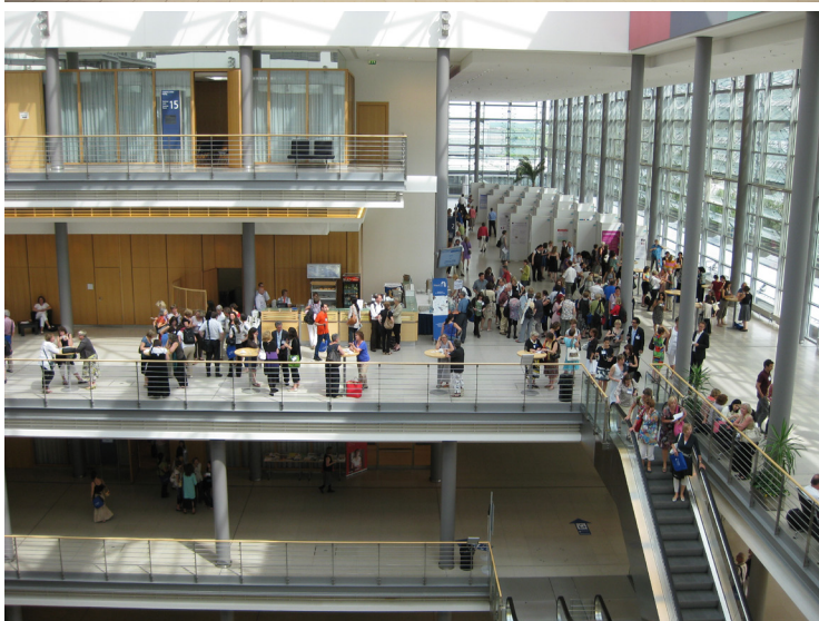
The photos from Leipzig and WAIMH 12th World Congress in Leipzig.