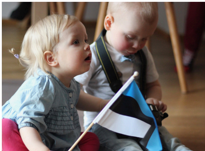
Estonian children