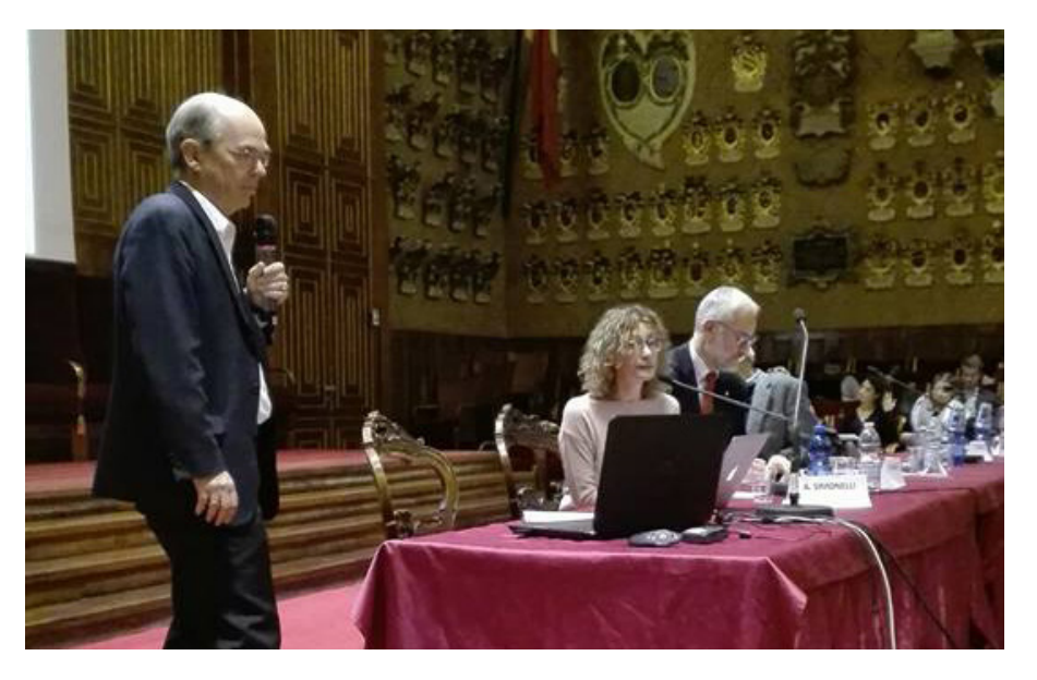
Picture from the Italian Association for Infant Mental Health congress on eraly development and mental health (Padua 2016).