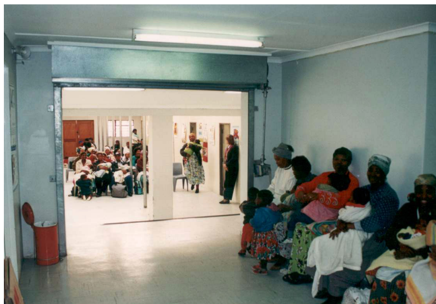
In the waiting room.

The first two items are simple questions of whether the parent is worried about the