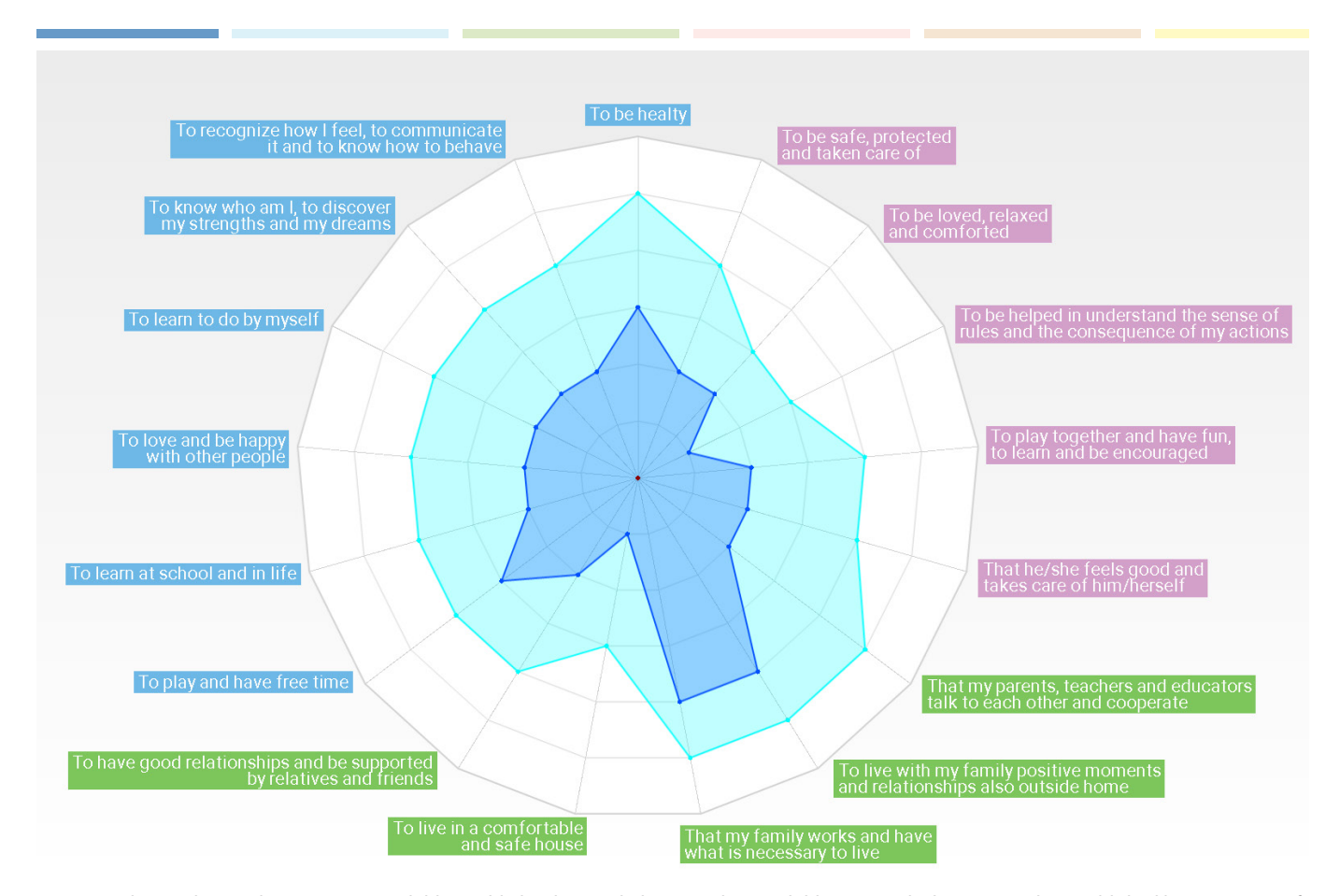
Picture: Radar graph regarding Francesco's "Child's World": levels recorded at T0 and at T2 (child version sub-dimension titles). Published by permission of the authors.

state the fundamental effect comparing information and negotiating can have on the results obtained by interventions, "The exchanges and relationships between the ECS educators, the home helper and the other social and health services involved were key to the success of the plan. Furthermore, in this case, the fact that an alternative strategy was all together thought of, contributed to working in the same direction, well aware of what the conditions and difficulties were. Periodically debating on the evolution of the plan, allowed one to "adjust the shot" and definitely made the intervention more effective"(ECS educator): "Initially, just as an observer. I was able to report to the ECS educators and to the services the family's resources and critical situations and thanks to a close contact between the different workers, we were able to piece together little strategies of intervention so as to strengthen the present moment abilities and minimize the critical situations" (home care educator). The innovative results of this "creative" method, with which a situation presenting a difficult parent was dealt with, is herewith summarized, "I believe that by a traditional approach to home care, we would never have managed to get inside Francesco's house" (social worker).