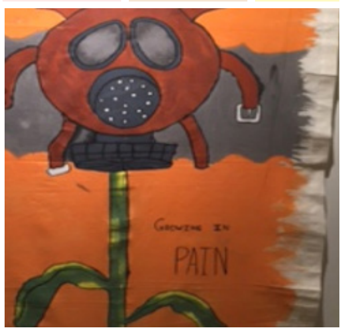
Art Credit: PATH Welfare Society (http://www.pathwelfaresociety.com)