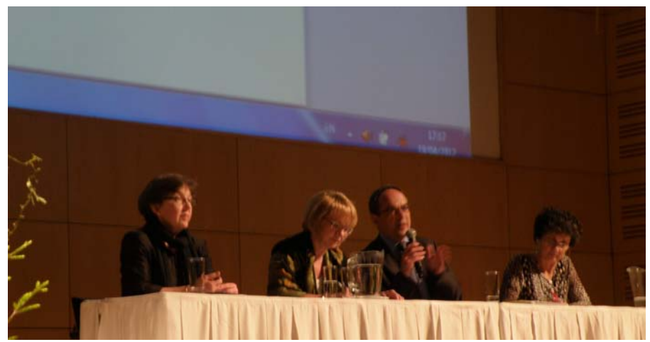
Photos (page 13-16) from WAIMH 13th World Congress in Cape Town by Minna Sorsa, WAIMH Central Office.