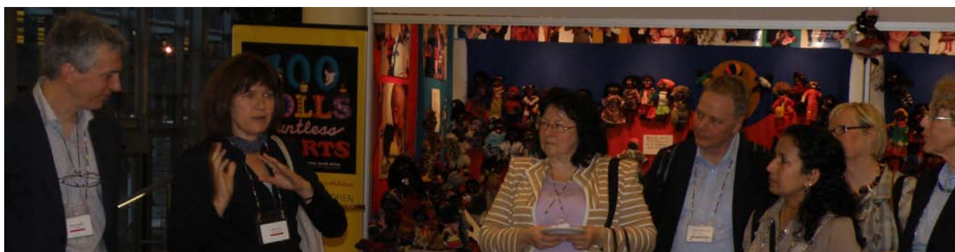
Photos (page 10-11) from Affiliate Council meetings in Cape Town in April 2012 by Minna Sorsa, WAIMH Central Office.