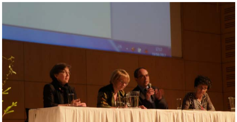
Photos (page 13-16) from WAIMH 13th World Congress in Cape Town by Minna Sorsa, WAIMH Central Office.