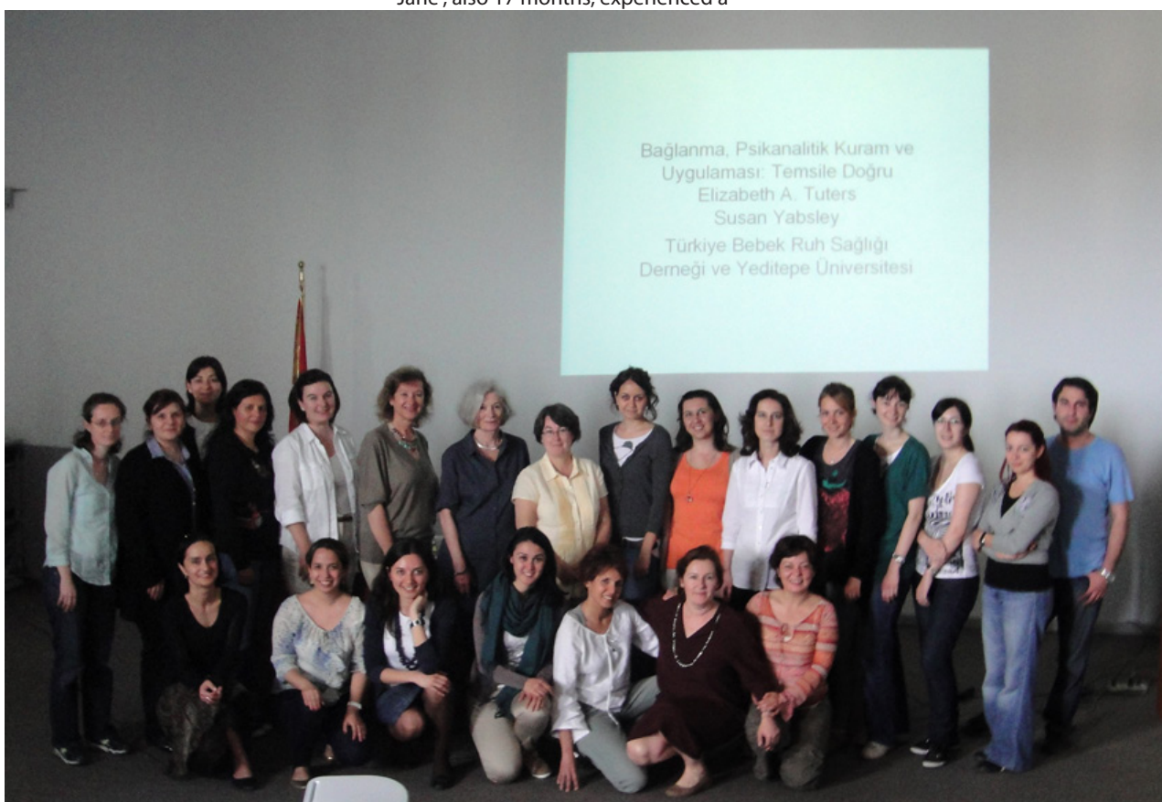
Trainees in group photo.

Day Two focused on the two approaches of infant-parent psychotherapy we utilize most. Again, we had a PowerPoint presentation describing the approaches translated ahead of time; however, as we were also showing clinical material which could not be sent ahead, and the subtitles were in English, the text had to be translated on the spot as it appeared on the DVD clips. The translators were