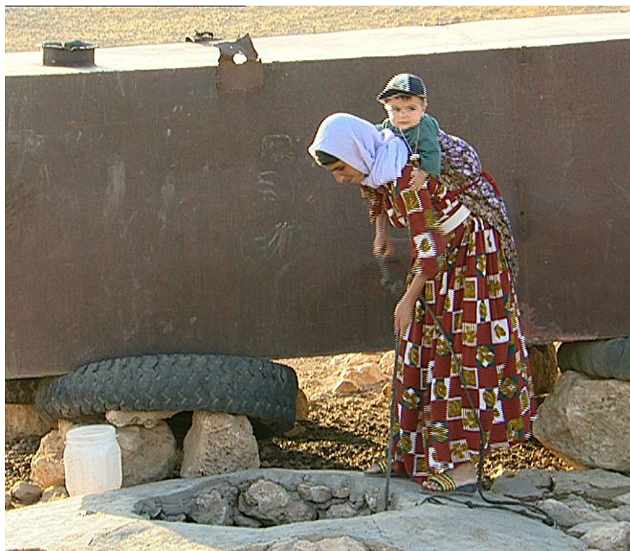
The above picture of a mother and a baby, and the two photos on the next page are from the lullaby documentary by Tülin Sertöz (read more on page 19).