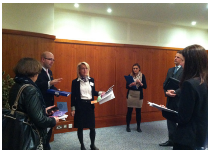
The preparations for the WAIMH 14th World Congress include a site visit.