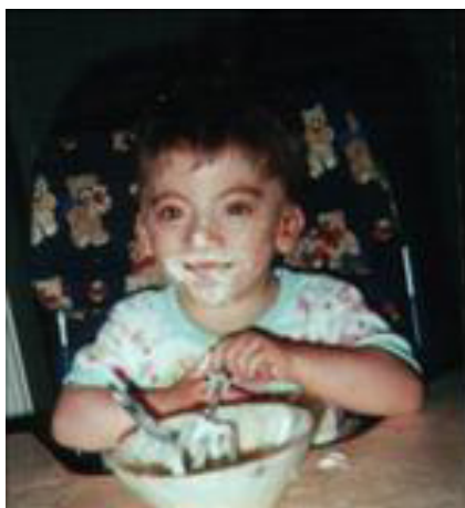
Picture from the Graz Hospital for Sick Children, Austria.