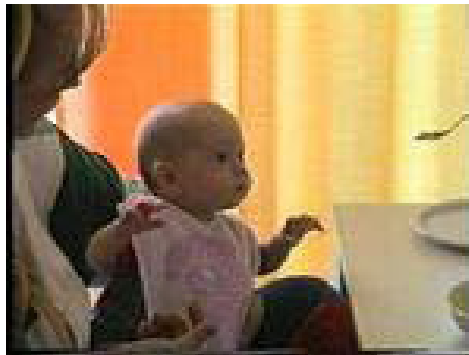
Picture from the Graz Hospital for Sick Children, Austria.

wonder” a concept the famous American psychoanalyst Selma Fraiberg addressed in her work. Self regulation means that the baby is equipped with biorhythms regulating basic things like the wake-and sleep pattern and the hunger and satiety cycle. Self regulation also means that the grownups involved learn to trust in the baby’s capacity to be able to do things by itself, to be able to regulate hunger and satiety, even if it has been suffering from great pain for many weeks or even months. Since the baby has the same potential of becoming